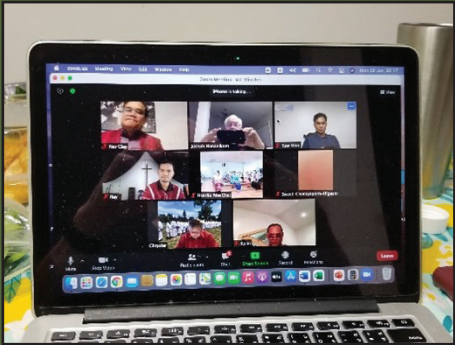
Karen youth from 6 Southeastern states joined the Zoom service in Huron, SD.