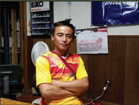
Mechanic gave his heart to Christ at the auto repair shop where we were getting our van repaired.