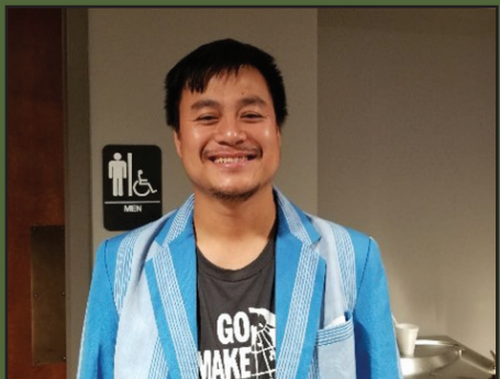
At the Omaha, NB Conference this young man after hearing the Gospel gave his life back to Christ.