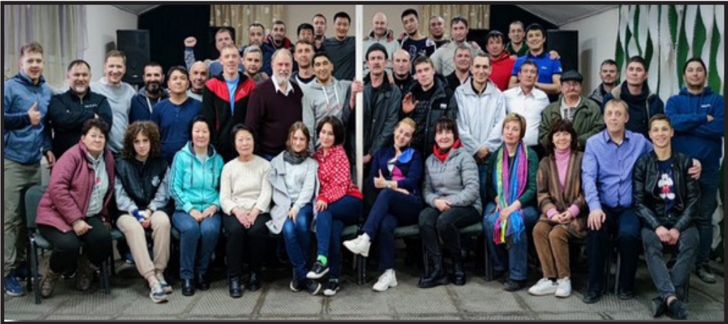
The School of Christ in Bishkek, Kyrgyzstan.