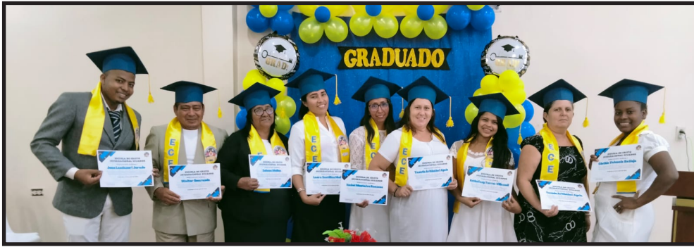
Ecuador SOC Graduates

The testimonies of what God is doing through the teachings are excellent. We have just celebrated the graduation of Pastors and Leaders that have just finished the