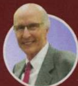
DON SHOOTS PASTOR