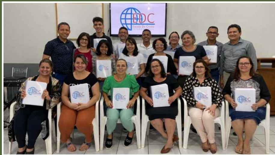
SOC graduating class in Vilhena, Brazil.