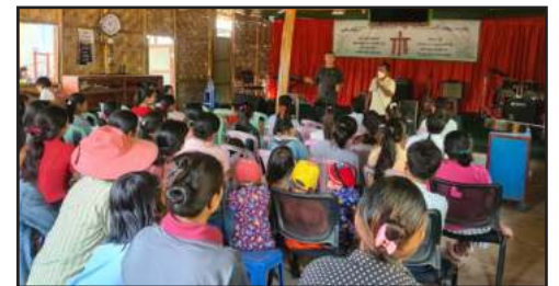
Ministering in a poor village in Cambodia.