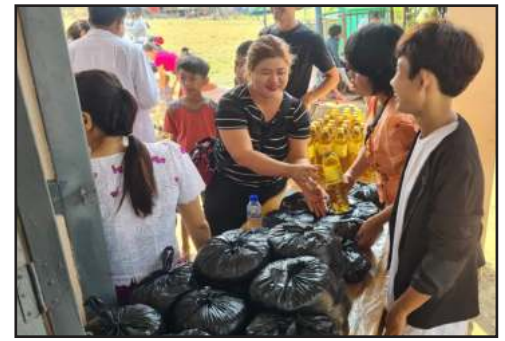
At the fifth village we distributed rice and oil to every family in the church.

The remote village of Chukon in the jungle was my sixth village to minister in. This is the first time a foreigner has visited this village. I am the first and only Christian to visit. Three years ago, a Myanmar missionary came to this village with his family and organized a small church. Unbelievers were invited