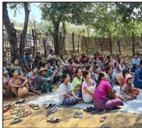
Over 75 people came to hear the Gospel before going to work at the first village.

when I visited their village last time attended the seminar. The pastors