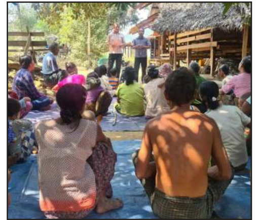
Ministering in the second village.

when I visited their village last time attended the seminar. The pastors