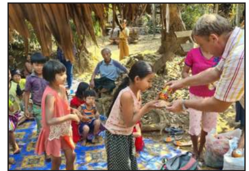
Giving snacks to the children in the second village we ministered in.

who attended a Bible School had knowledge but did not have power or life. The Holy Spirit worked in their lives, and their hearts were touched. We are now making plans to hold a full-time School in the fall. Thank God for His guidance and leadership. Praise God for the School of Christ.