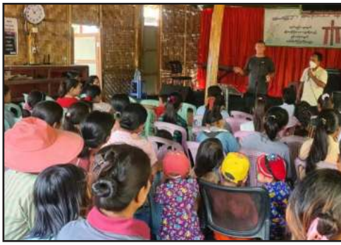
Ministering in the church at the third village.

Local Christians are keeping in contact with them to make sure they are in church.