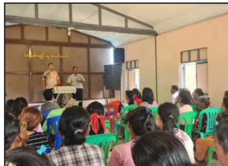
Ministering to the Christians at the fifth village I visited.

so the village could have clean water. They came and heard the Word gladly. Local missionaries are now in place to minister and disciple these new converts.