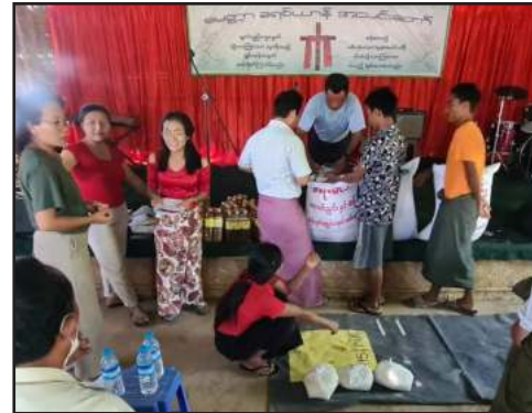
Distributing rice and oil to every home in this very poor village.

so the village could have clean water. They came and heard the Word gladly. Local missionaries are now in place to minister and disciple these new converts.