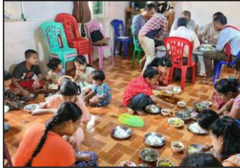
Ladies of the church in the fourth village served a wonderful meal to everyone who attended the service.

The fourth village in Myanmar had a small church. Everyone was invited, and we had an excellent