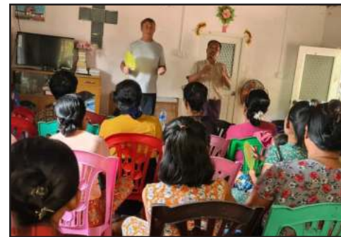
The fourth village had eighty people in attendance and forty came forward to receive Christ.

About eighty people came to the service in the third village. It is a small jungle village without electricity. At the end of the service, forty people came forward to pray for forgiveness of sins. They were given pamphlets and the Gospel.