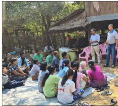
Ministering at the first village.

In Rahkin, I had the same experience. The Holy Spirit showed me that conducting the School of Christ was necessary. Therefore, this visit was to hold a School of Christ Seminar. I did everything as if we were running an entire School: one hour of prayer every morning, a full day of SOC lessons, and ended the day with another hour of prayer. Three pastors from different churches, missionaries, evangelists, and several Christians who converted from Buddhism