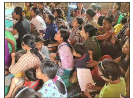
Christians and unbelievers attended the service at the sixth village.

“Thank You” to the people who pray and financially support the School of Christ International so the work of the Lord can go forward. All glory and praise go to God! May His name be glorified to all the Earth!