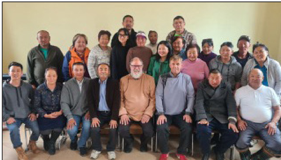
Mongolian SOC graduates.

2013 and heard the Lord call them to a new location. They left their comfortable churches for a challenge in the more difficult part of the country. If the Lord allows, we will