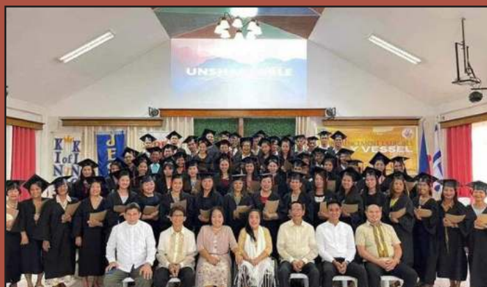
103rd SOC graduating class in Pangasinan, Philippines.