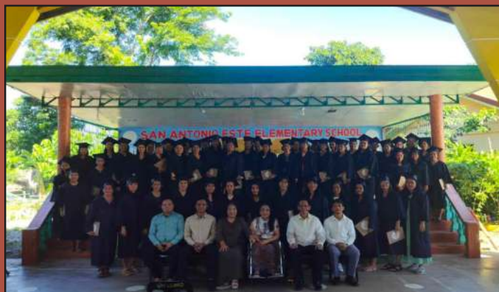
103rd SOC graduating class in Lupao Nueva Ecija, Philippines.