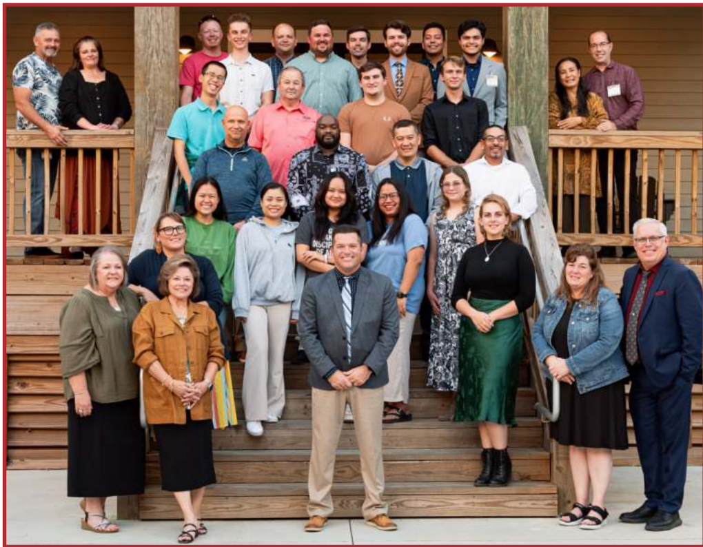
SOC Summit 2024 attendees.

“The SOC has shown me what I need to work on in my life. It has given me the knowledge of how I am