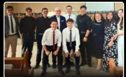
Students of the SOC in Viamão – Brazil 2025